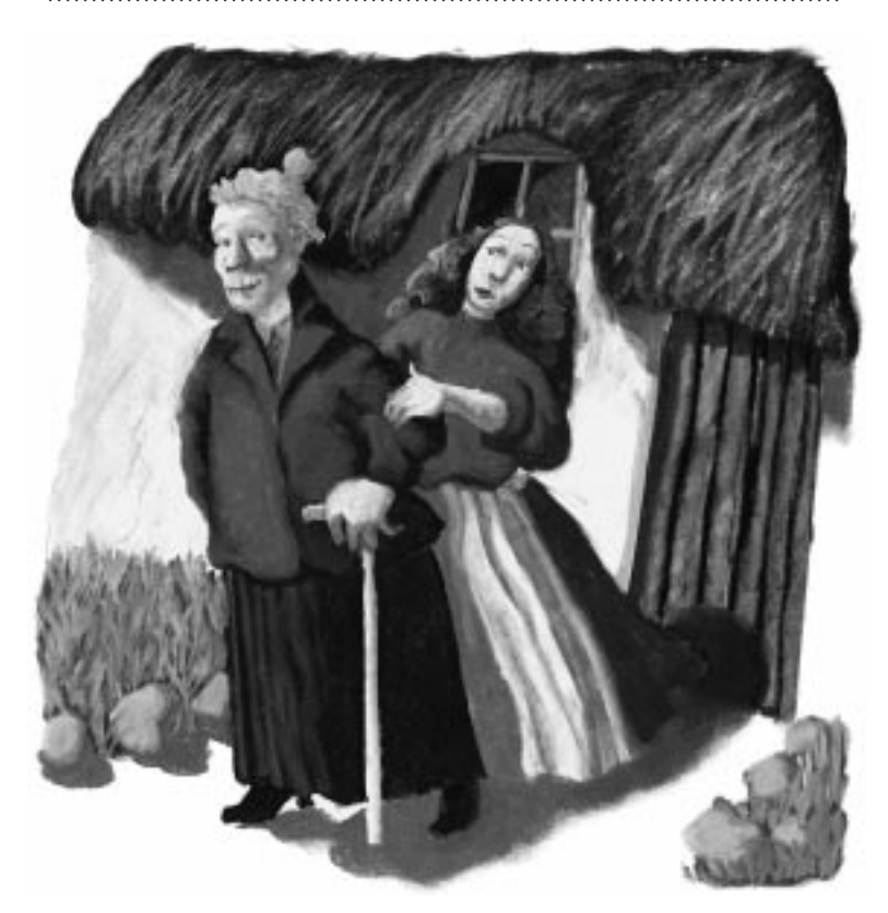
She is carrying a walking stick in her left hand.

In the middle of the morning an old woman comes slowly out of her house. She is wearing a blue coat, a black skirt and brown shoes. She has got grey hair. She is carrying a walking stick in her left hand.