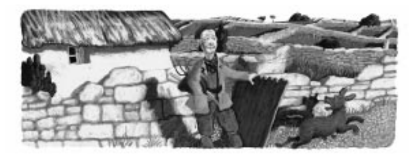
He is going to work in the fields.

It is early in the morning in Parkgate. Parkgate is a village in the north of Ireland.