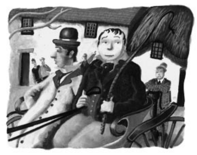
'That's not the man from Peru. It is Lord North.'

'No, it isn't,' a man says. 'That's not the man from Peru. It is Lord North. He is going home from town.'