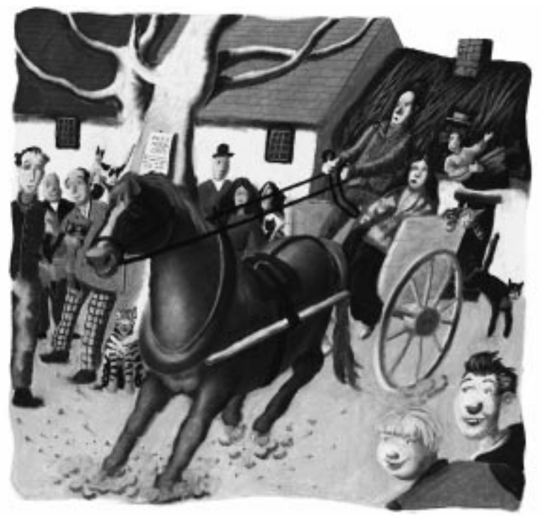
Some people come in a pony and cart.