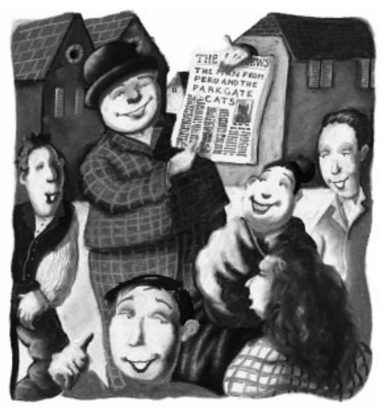
Next week the story is in all the newspapers.

The two boys walk slowly away from the centre of the village.