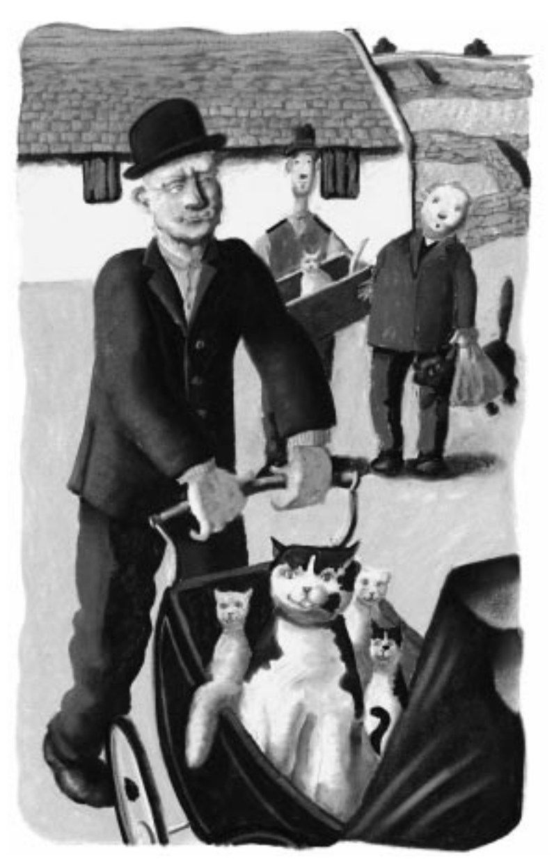
One old man brings a cat and three kittens in a pram.